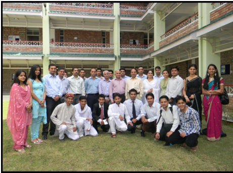
Students of MBA Tourism & Travel

World Tourism Week on the theme “Tourism Linking Cultures” was celebrated from 20 th to 27 th September.